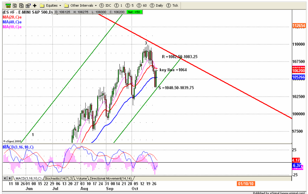
ESZ9 DAILY Chart

ES bounced from its oversold condition. Today it is decision time. Should it continue its downtrend or resume uptrend again? It all depends on how price reacts on this key range 1064-66.50. Based on previous pattern, there is bearish M pattern; it indicates that ES should go lower; yesterday's rally might just be window dressing for the end of month. But as long as the medium-term uptrend line holds price up, there still has a chance for bulls to regain control and push price back up high level and challenge the long-term resistance line (red) again.