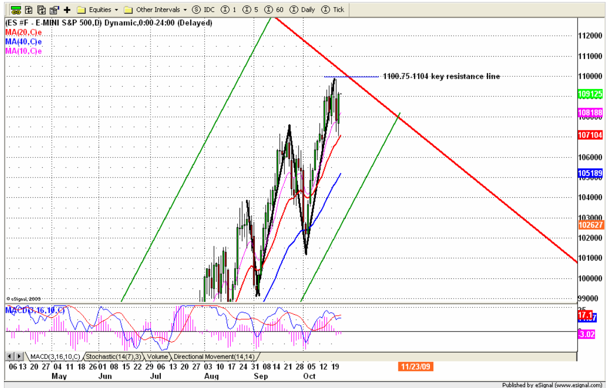
ESZ9 DAILY Chart

ES bounced up from its major support line (20 day EMA) and passed through yesterday's breakdown point 1080.25 to retrigger buying. Today 1080.25 will become an important line. As long as this line holds ES up, the odds will interpret that the uptrend still hasn't completed yet. A push up to an extreme high around the major resistance zone to make new highs is very possible. At the meantime, today will be the important day for bears to defend this long term resistance zone. As long as the price doesn't breach the 1098.50 line, the sellers will continue fighting for their territory.