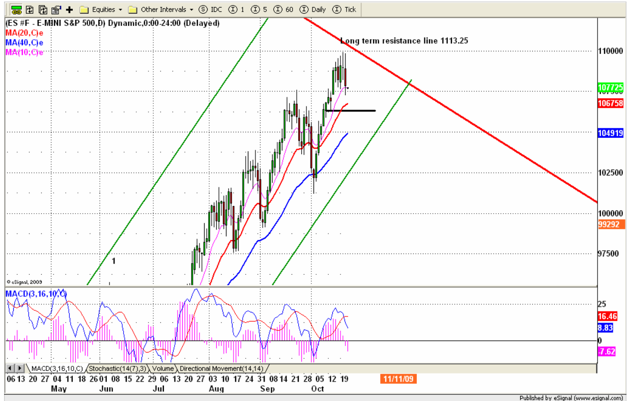
ESZ9 DAILY Chart

ES finally had its first declining move. But yesterday's decline hasn't changed the uptrend direction yet. Bears need to do lots of work in the coming two days. Otherwise, bulls still have a chance to regain the power. Today and tomorrow, ES needs to hold price down below 1093.75 line and continue pushing price below 1063 to get into that medium-term uptrend line (green). If ES can move above yesterday's high 1098.50 line today or tomorrow, then it likely will break out the long term resistance line in the coming week.