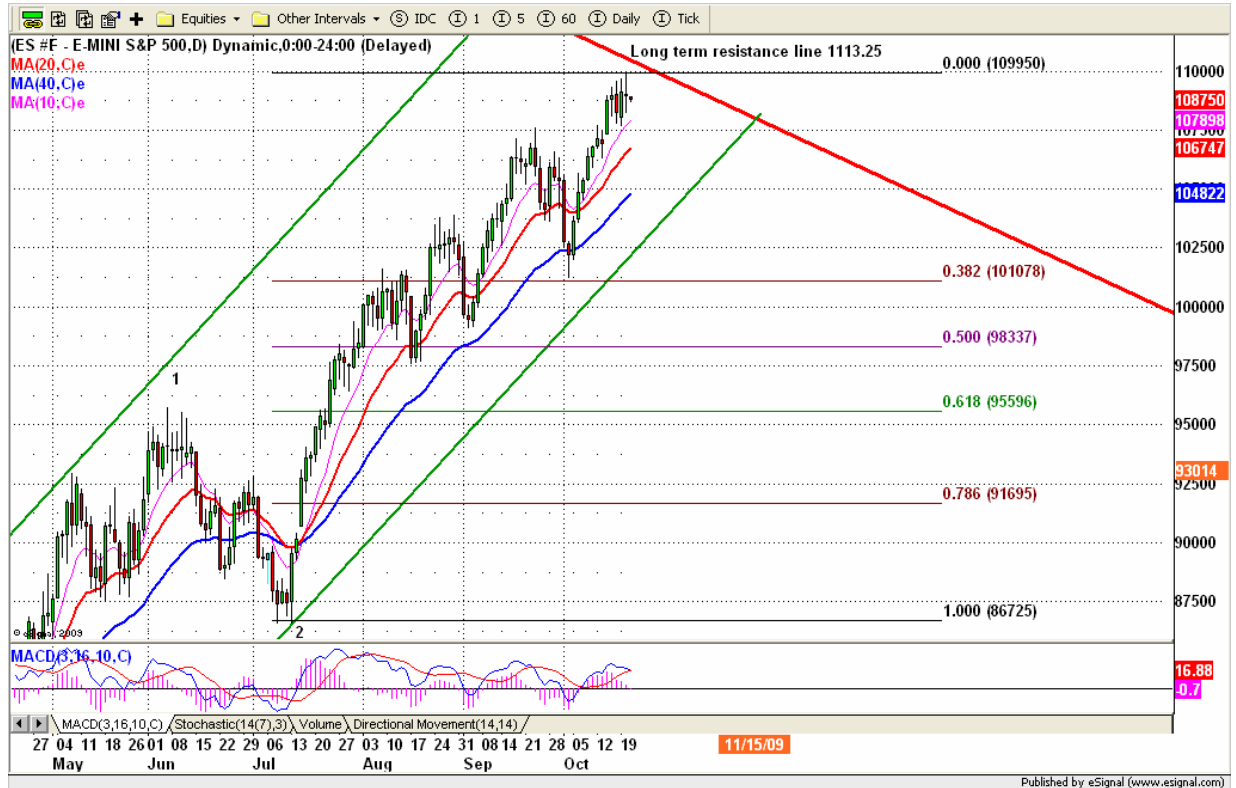
ESZ9 DAILY Chart

ES paused around its long term major resistance area. So far it hasn't made its decision on its next direction yet. But yesterday heavy volume on the downside could be decisive. Today if ES moves below 1079 line and closes below it, 1067-64 range will likely be the next downside target. In order to change this latest uptrend, the bears have to fight harder to push the price below 1035 line to change the trend direction. Otherwise, current declining still can be treated as a small pullback.