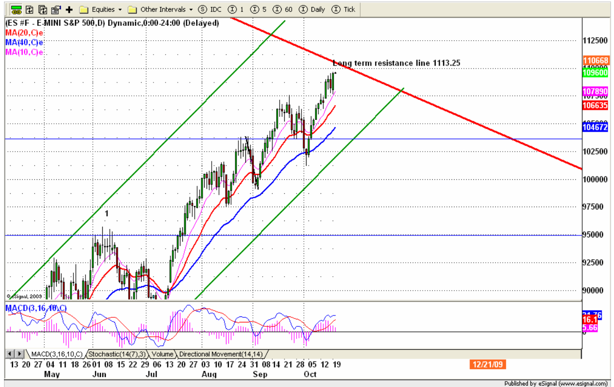
ESZ9 DAILY Chart

Big earning season is on the way. ES will remain bullish as long as 1078 line holds up. ES will attempt to move higher to make a first attempt to breakout long-term resistance level 1113.25 to trap the buyers. Yesterday upside movement without high volume support indicates the current rally may be in the last stage. As soon as the upside momentum runs out, the correction will be fast and nasty within in a short period.