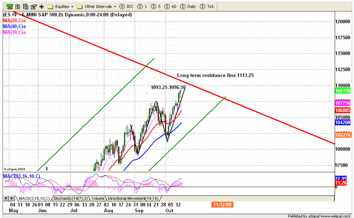
ESZ9 DAILY Chart

ES completed its bullish butterfly pattern. Also it had 9 days up in a row. Put/call ratio reaches its extremely bullish level and VIX index slightly broke support line. The sentiment from AAll also shows 47% bulls vs 37% bears. All indicate our stock market is under the bull's hand. We don't expect a big correction will be on the way soon. But a small correction should be expected after this option expiration day. Usually the first time the price approaches a long term resistance line, many investors look to cash in some of their profits.