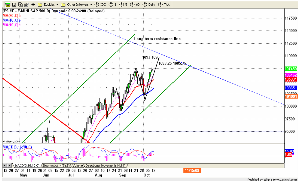
ESZ9 DAILY Chart

ES held above major support 1062 line. As long as this line holds up, the bulls will continue fighting for 1075 or higher to complete the bullish butterfly pattern. Today a breakout above 1076.75 will be bullish especially if ES can hold up breakout point. The 1083.25-1085.50 range could be first target for breakout run, and 1093-96 range remains target for uptrend move.