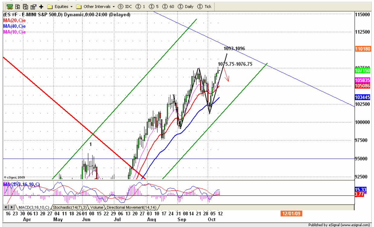
ESZ9 DAILY Chart

ES paused around its previous high 1075.75 area yesterday. It gapped up and held above 1073.50 quite a long time until it gave up later afternoon. Because yesterday was a holiday the volume was very thin. Plus it was first day of option expiration week. If ES can't breakout 1076.75 this morning, then it is likely to pull back into 1058 area before it tries going up again. It is very possible for early morning session to repeat yesterday's range if overnight trading is muted.