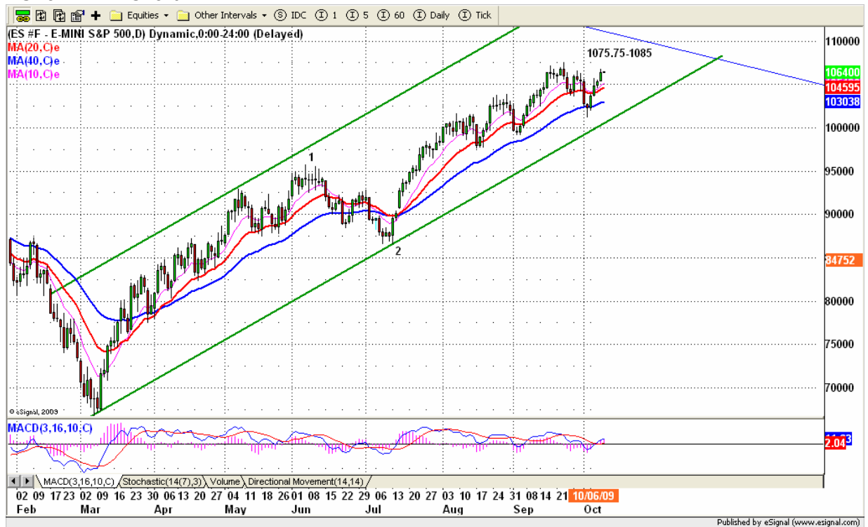
ESZ9 DAILY Chart

ES gapped up strongly at open and held up for closing. It indicated that ES was bullish and attempted making new highs. But one thing brings us attention is that ES was struggling back up 1065.75 all afternoon, and it failed. Tonight if ES still is unable to move above 1065.75 line, it could pull price down first and reverse up at the end of Friday. In this case, 1068-67 could be short-term Top again. If ES is able to move up to 1072-75 range, we may see new highs in the coming weeks.