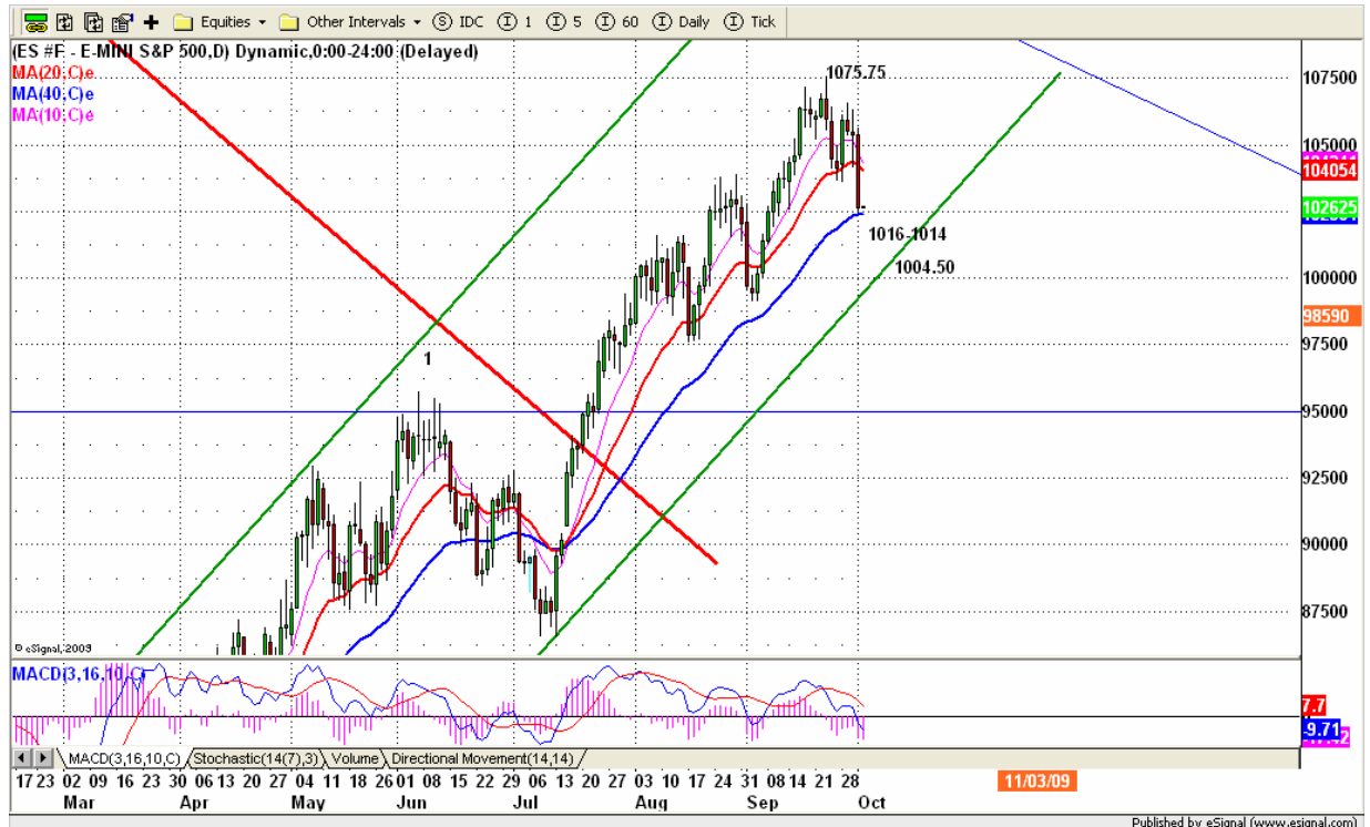
ESZ9 DAILY Chart

First day of Oct., the market was in the hurry undo the end of quarter window dressing.. ES not only broke its 10 days moving average line, but also it broke its 20 day moving average line. At the end of the day price was just sitting above 40 day moving average line. Broad heavy selling hit all the markets except bond market. The advance/decline ratio was very negative — adv. vs dec = 1:5. — but was very similar to the first day of Sept. Today we may see ES go down a little further to shake out weak longs and then bounce up for closing.