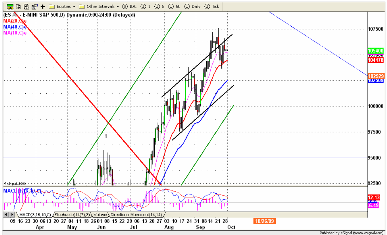
ESZ9 DAILY Chart

On the last day of the third quarter, both sides struggled. Finally bulls still won September month. Today is first day of October, the battle will continue. Even though there is no clear sign for which direction ES will go, last Monday's high is very important for today. If ES stays below 1065.75, that indicates there is at least one more push on the downside to test 1035-33 area before price goes back up to make new highs.