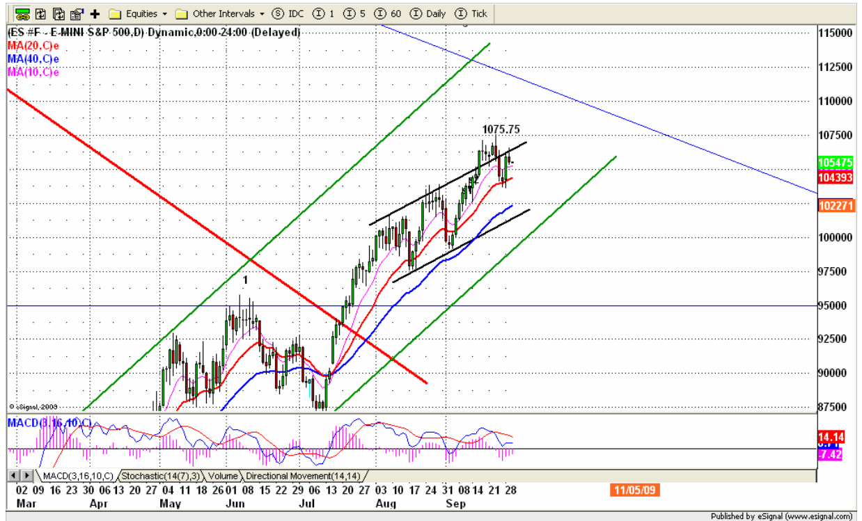
ESZ9 DAILY Chart

ES popped up above 1061 line by news in the early morning session. But after news report, ES sold off and stayed below 1061 key line for rest of the day. It indicates that downside correction hasn't completed yet. And today it is likely for this correction to continue.