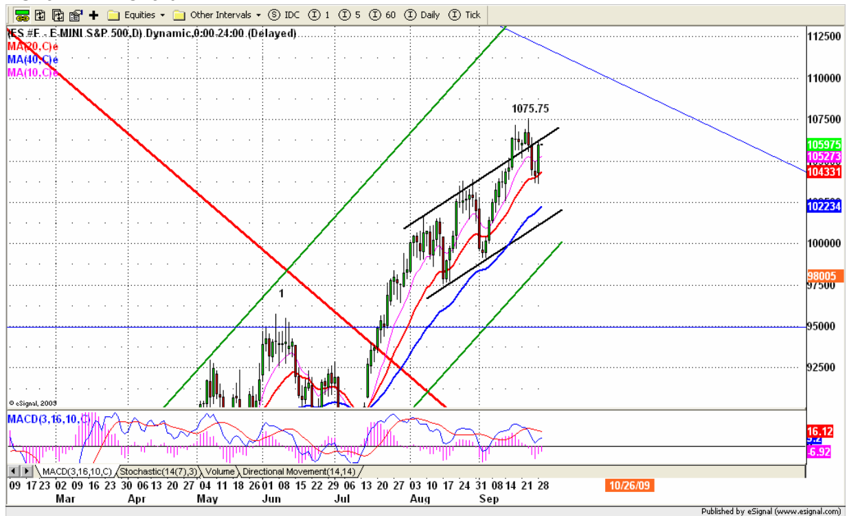
ESZ9 DAILY Chart

ES bounced up to retest its previous resistance level around 1060.75-1062.75 range. If today ES can hold price below 1061, the short-term downside correction may not be completed yet. But if ES can move above 1066 and closes above it, this then indicates that short-term correction is complete and new highs could be made in the coming days. For the downside, 1050-1049.50 range is key. As long as this range is holding up, a sideways move in preparation for an attempt to breakout to the upside is very possible. Consumer confidence report could determine which direction ES should go.