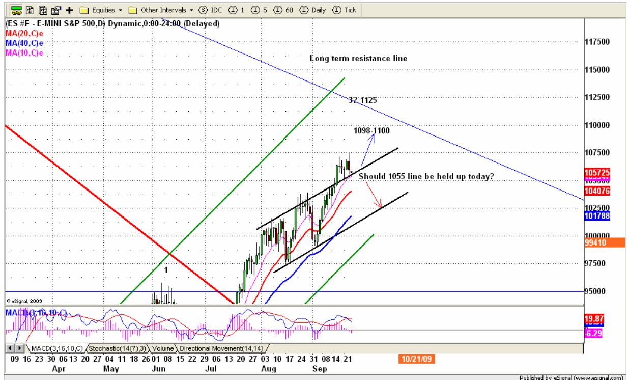
ESZ9 DAILY Chart

After Fed interest rate announcement, ES did same tricky movement - pumping and dumping. It sold off from our weekly first selling level and landed on our daily first buying level for a 20-point move. It excited many day-traders, but annoyed many of the latest buyers. Today will the 1055 key line hold up? 1055 is bullish W pattern neckline. In the past ES broke that neckline and went up. Yesterday ES just pulled back down for testing this broken neckline. As long as this line is holding up, the short-term trend remains up. If ES can push price below this neckline, then short-term trend could be forced to change its direction. In other words, we may have seen the primary wave 2 top already.