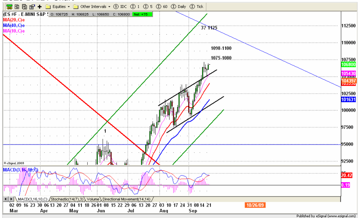
ESZ9 DAILY Chart

Basically ES is holding up its breakout line. As long as the price doesn't go below this breakout line 1054, the uptrend remains intact. It seems to be slowly moving up in a very choppy way, squeezing the shorts and frustrating many bears.