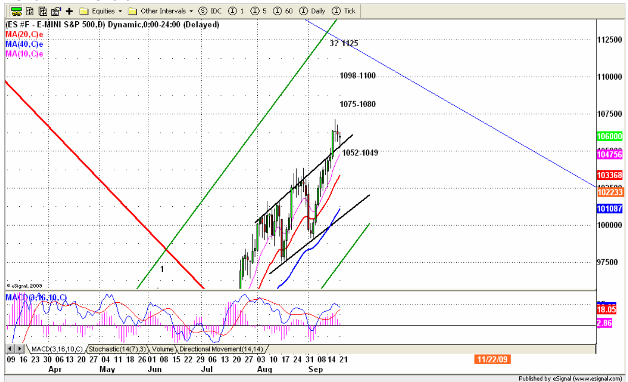
ESZ9 DAILY Chart

Decision time. Will the market hold up support line 1052-49 for a move up to 1098-1100 or break the support line to retest the 20-day ema around 1033.75. Today ES needs to make its decision for the next leg move. So far medium term indicators are in uptrend tracks, while the short-term overbought situation has been smoothed out internally in the past three days. We might see two possibilities : One, holding up 1052-49 range today and keep squeezing the shorts to push the price up to 1075-80 or higher to 1098-1100 area. The second, the discovery that the upside breakout is a fake, and a gap down open today below 1046 to create selling pressure, and push the price to lower to 1033.75-31.75, which would be quite bearish.