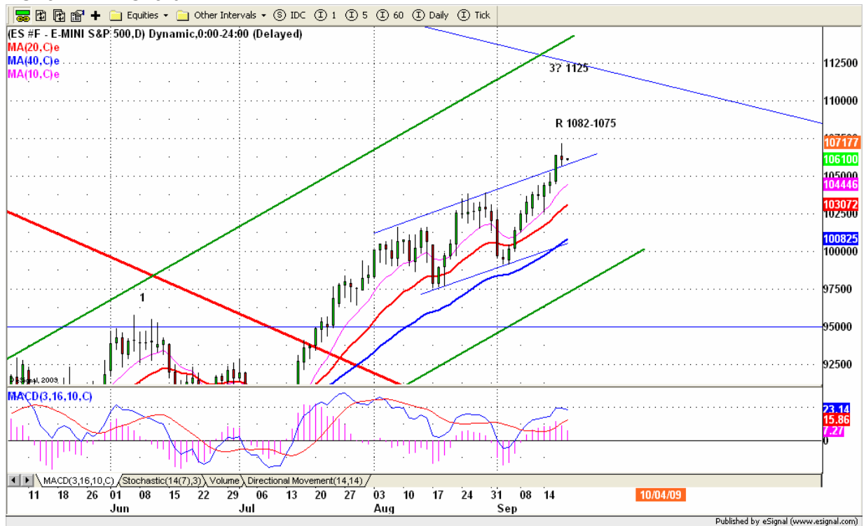
ESZ9 DAILY Chart

ES just pulled back for testing previous resistance level. If today ES still can close above 1062.50 line, it means the 3rd wave of subwave 3 still hasn't completed yet. It is likely for price to move higher. A move below 1050 will be negative and a further down toward 1044 direction would be expected. Yesterday the market showed a little sign of waning on the upside, but other indicators remains strong. Due to option expiration, ES may well be held up for today and next Monday, and then selloff after those days.