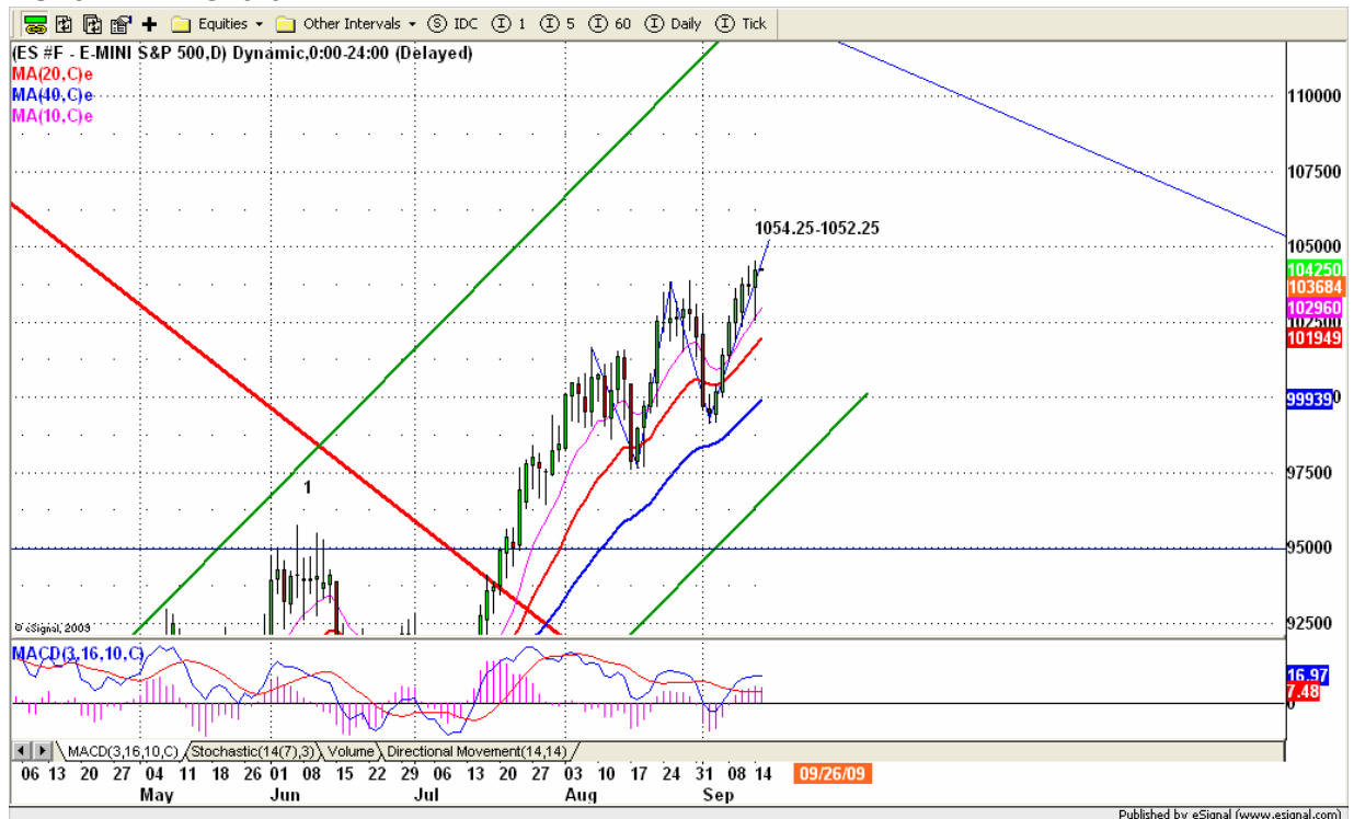
ESZ9 DAILY Chart

ES has had 7 days gain; it is also near its bullish W pattern final target 1054.25 area. The strong upside momentum corrected the overbought condition internally. As long as momentum is strong, it could push the price higher to 1054-52.25 or higher to 1070-72 area before it takes a small break again. The final target of the sub-wave 3 of primary wave 2 is laying around 1158 level, still far way from the current price. As long as the two major daily support lines (20/40EMA) are holding up, the buyers will not give up easily, even though the price climbs up like an escargot.