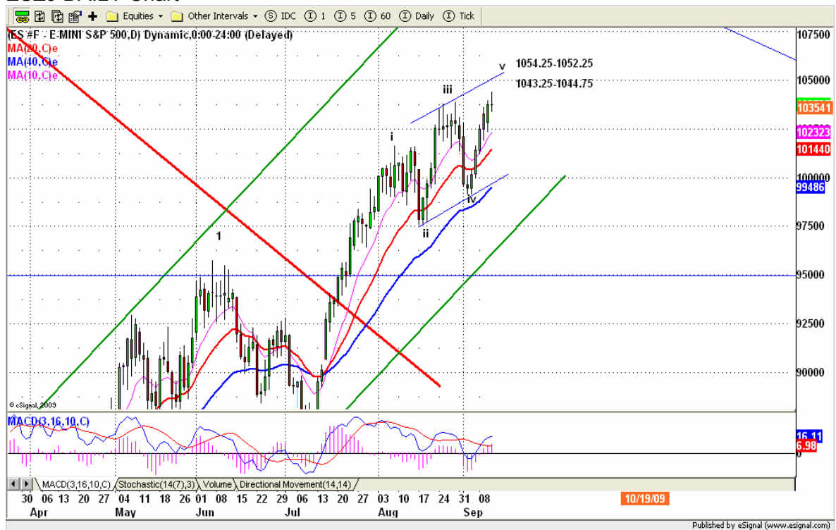
ESZ9 DAILY Chart

ES has bullish W pattern on daily chart. The pattern final completion target is around 1052.25-1054.25. But the short-term has overbought condition (medium-term in neutral condition). In the recent past, all short-term overbought condition have been nicely corrected by internal trading. Should the same occur this time too? It may. Based in AAI data last week showed 37% bullish vs 44% bearish, this figure could be pushed up while our market goes higher in the last rally-ending stage. Therefore 1052.25-54.25 range remains the focus of our attention for this week as long as 1025 line holds up the price. I told what weekly short-term swing traders would do in the room, Watch for major resistance level carefully, and don't get trapped by a fake breakout move.