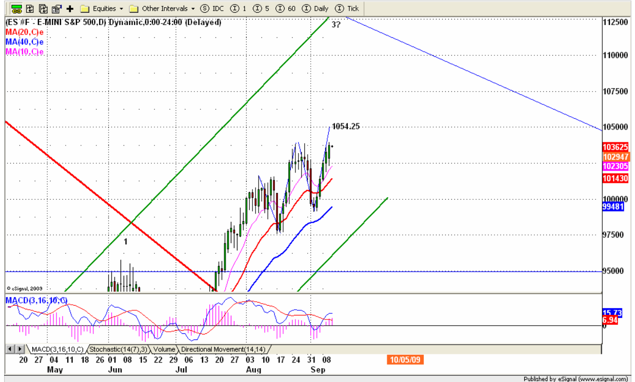
ESZ9 DAILY Chart

ES has had 5 days gain; it also gets closer to its bullish W pattern final target 1054.25 area. Today could be the day if overnight trading holds up the 1033 level. Also the price has reached the time when major swing short positions scale into this market for short-term trades. Plus short-term the price has had an extremely overbought condition again. Any price above 1048 line, we will see more sellers than buyers.