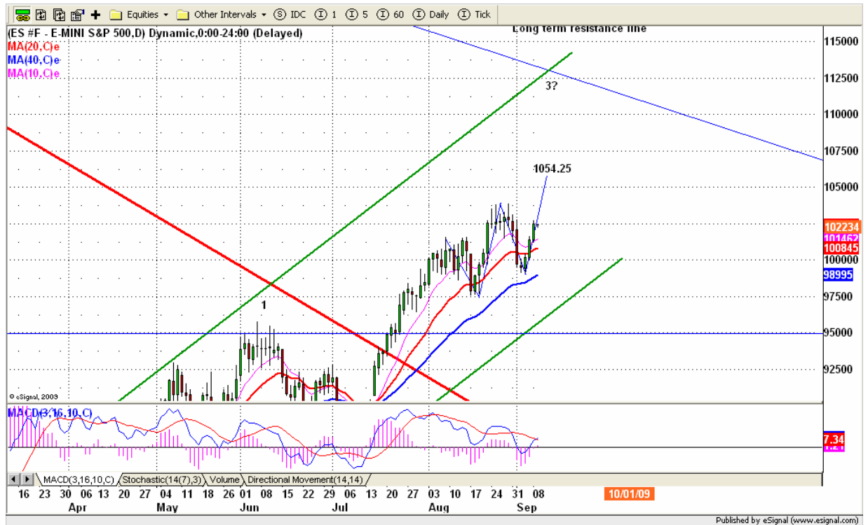
ESU9 DAILY Chart

Our stock market followed Chinese market for recovery. ES moved above short term support level (10EMA daily) yesterday for closing high range. Even though the range was very narrow yesterday, the price got a second day follow-through. It seems ES could go higher if today or tomorrow 1014 can hold up firmly.