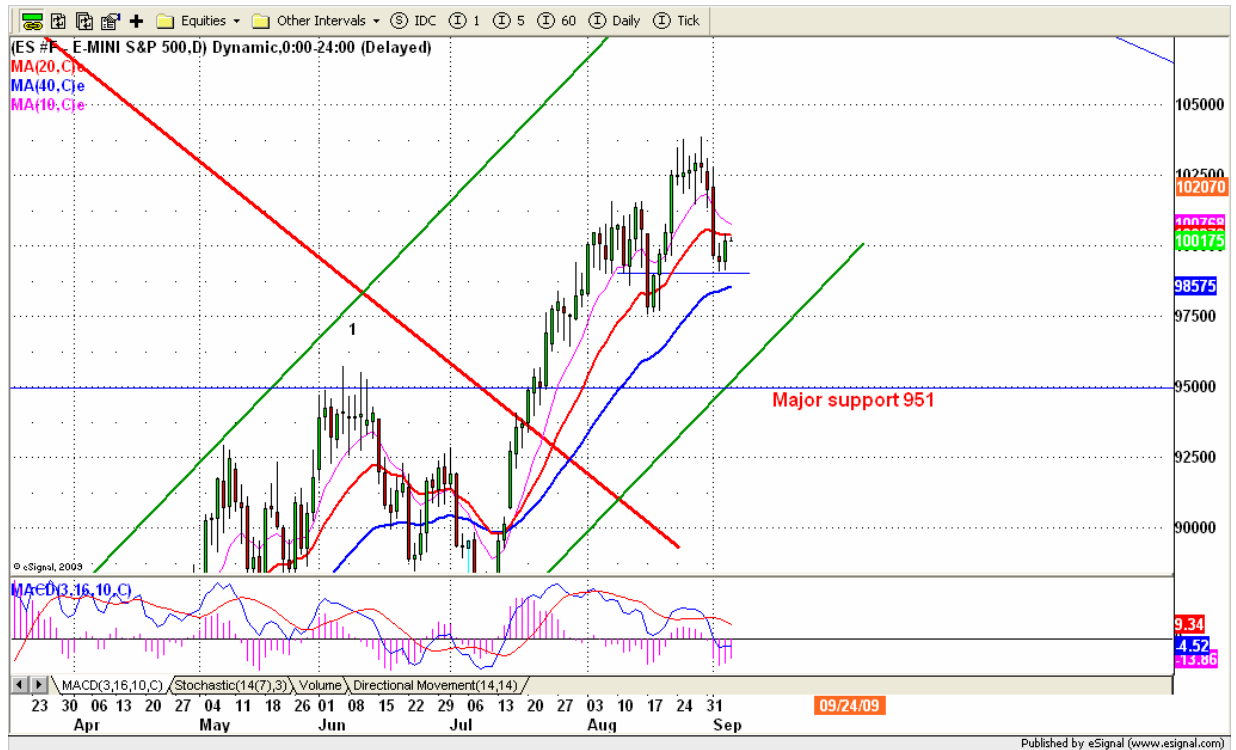
ESU9 DAILY Chart

If ES intends to go down further, it should stop bouncing today. We may see one more day to repeat yesterday's range move. As long as price doesn't work above 1015-16 range, the short-term downtrend remains intact. Next Monday is a holiday, and many traders will leave this market early today for the long weekend.