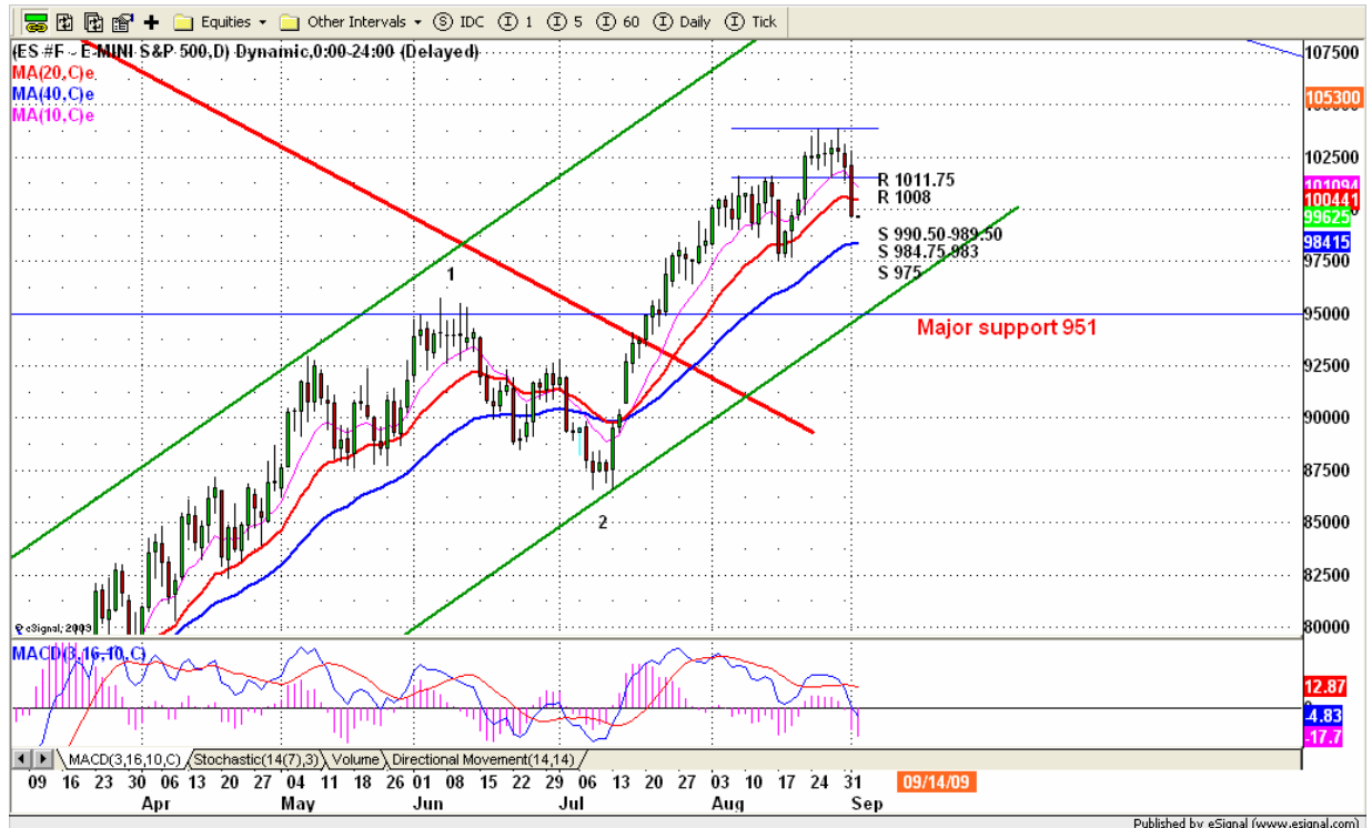
ESU9 DAILY Chart

Today we may see a bounce day. But as long as ES stays below 1011.75, the short term trend remains down and further down move still should be expected in the coming days. If ES moves above 1031.75 line, it will indicate another leg up of sub-wave 3 is on the way.