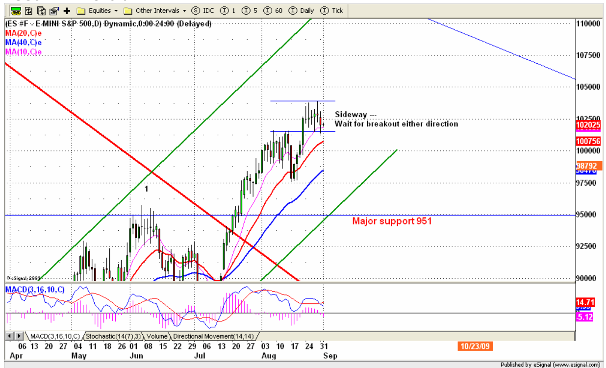
ESU9 DAILY Chart

For first day of September, we may see small holiday rally if ES holds up yesterday's low 1013.25. But as long as 1031.25 line holds ES down, we still have a chance to see price going down in the coming weeks.