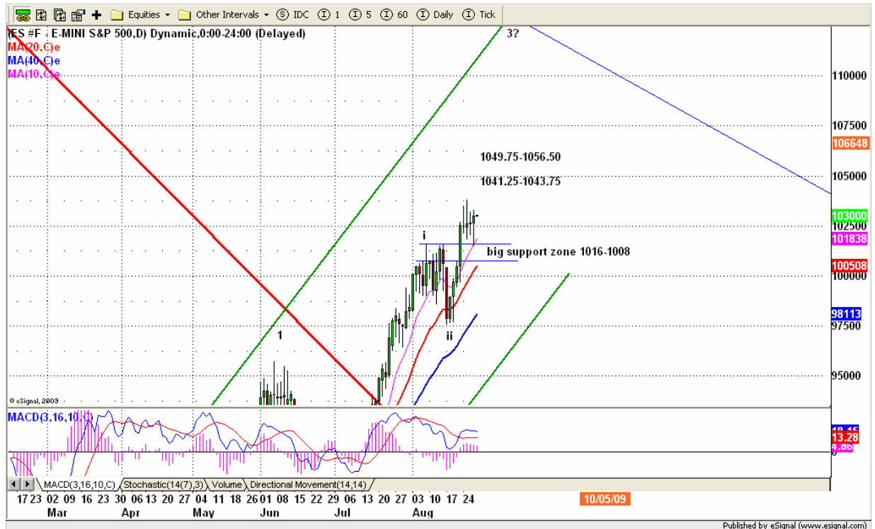
ESU9 DAILY Chart

But we are at the last two days of August, and it is possible for us to see price running up in the early morning and a big pull back later — like yesterday's move, but going in the opposite direction with a hook pattern again.