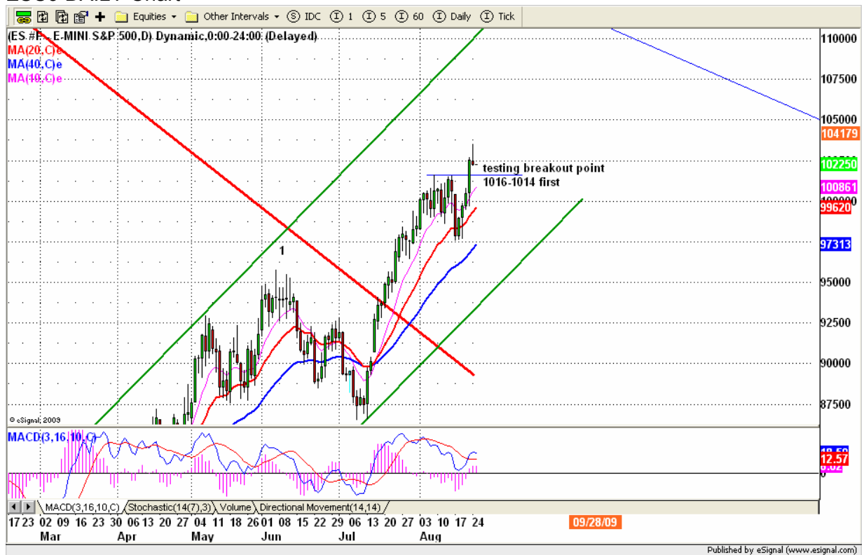
ESU9 DAILY Chart

ES intends to pull back and retest last Friday's breakout points area 1016-1014. Today if ES fails to hold up 1012.50, it is likely to move down further to retest 10 and 20-day moving average lines. The market is very vulnerable for short and medium term overbought correction.