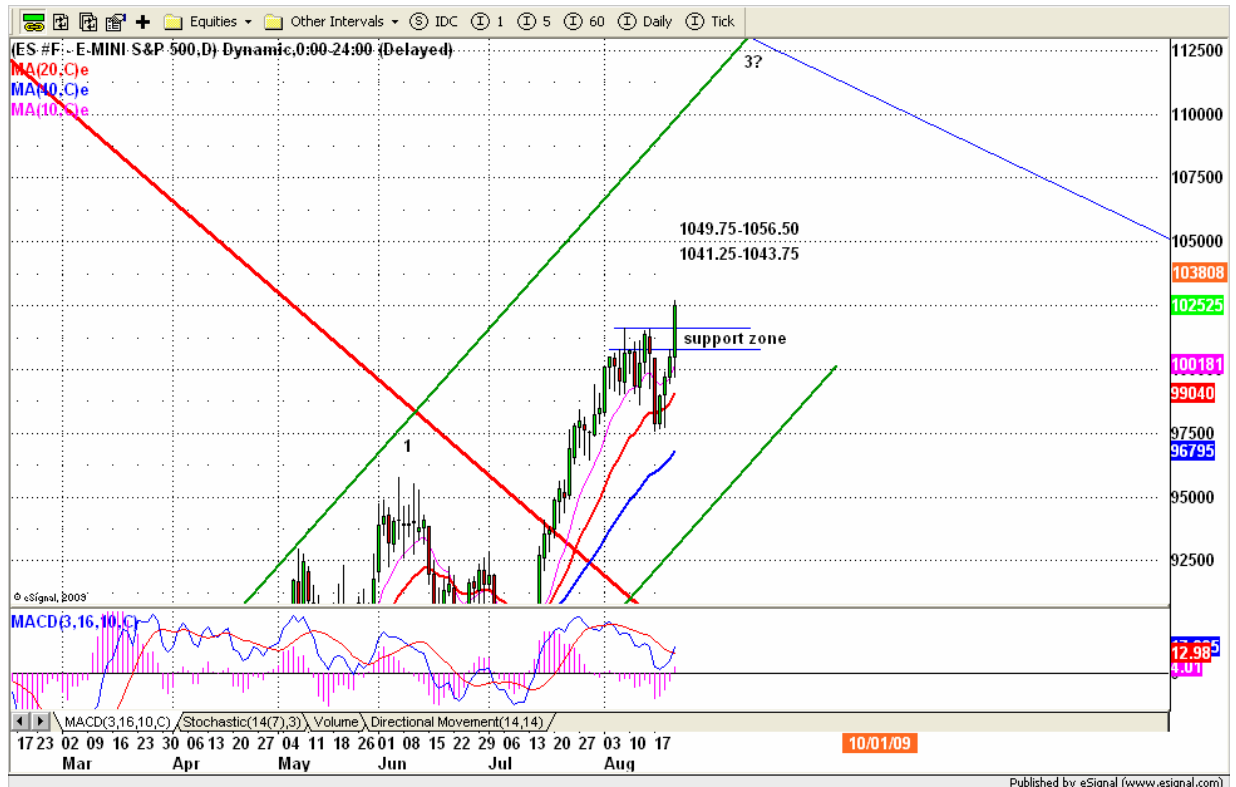
ESU9 DAILY Chart

ES broke out the previous week's high 1016 on Friday and closed up for expiration day. Now 1016-1007.75 turns into a support zone. And this support zone needs to hold for ES to reach the major upside target 1041-43.75 or higher to 1049.75-56.50. Because last Friday was option expiration day, and even though the existing homes sales report blew out the shorts, it doesn't mean that the shorts will not regroup for re-shorting this week again. If today ES opens below 1014, it is likely for it to move lower to fill last Friday's gap around 1004.50 area before the price bounces up again.