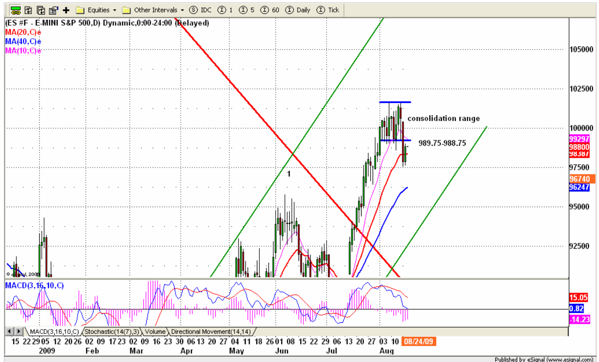
ESU9 DAILY Chart

The day gets closer and closer to option expiration day. Anything can happen within option expiration week. High volatility move should be expected.