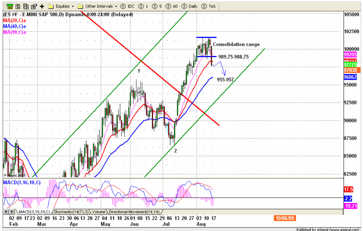
ESU9 DAILY Chart

The rally from July's low is ended and confirmed by yesterday's break of the 988.75 line. The decline from Aug 13 may continue until ES finds its support level. So far we can only treat current decline as retracement of July's low to Aug 13 high. As soon as this retracement is complete, the new rally may resume. In short term, as long as 1000 line holds ES down, the short-term trend should stay down.