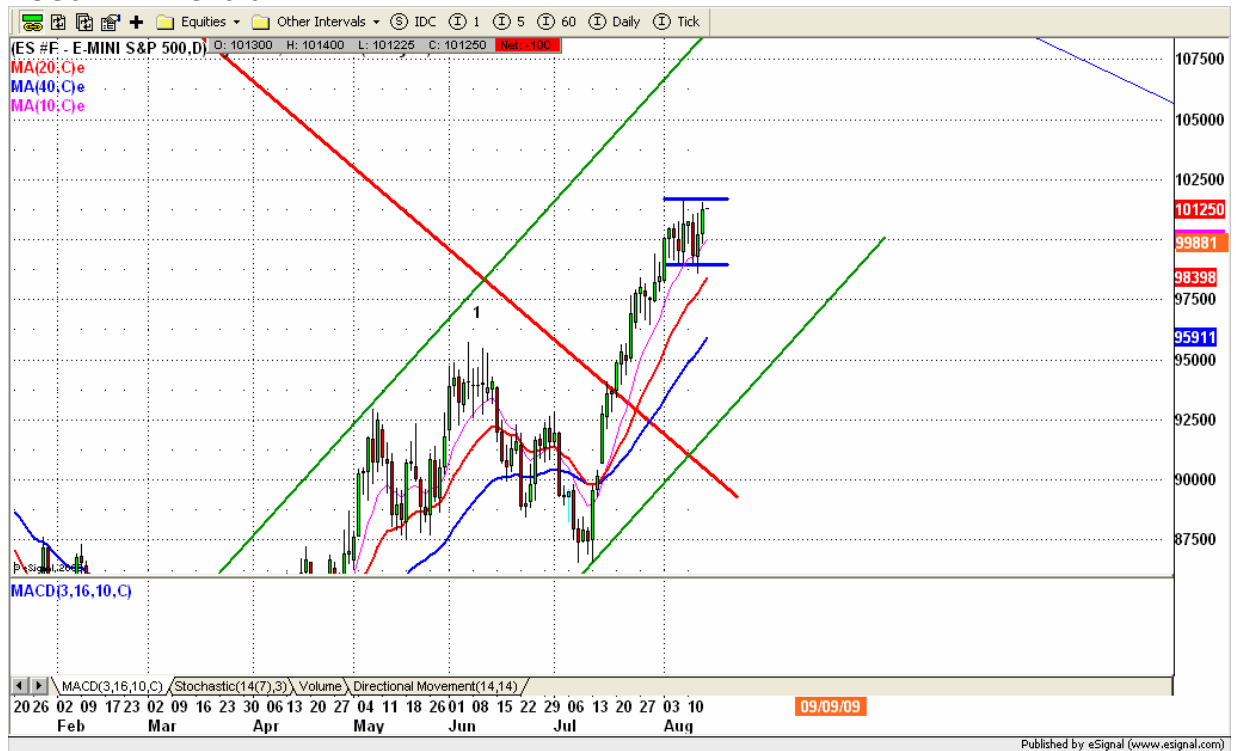
ESU9 DAILY Chart

Recession is over, Investors all enjoy and cheer the current moment and totally forget about how painful it was in the last year. Later investors chase and push the market price up higher and higher. AAll survey today shows 51% bullish vs. 30% bearish sentiment from our investors. This survey proves what I said previously — we are getting into SHORT TOO EARLY and BUY TOO LATE stage. Now we need to wait for the bearish sentiment to fall even further, perhaps as low as 20% or less. At that point, there will be no buyers left to enter the market, and the market top will likely be formed.