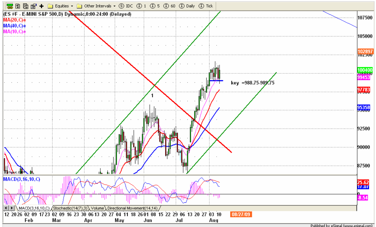
ESU9 DAILY Chart

Last two days move lacked clear direction. It indicates that ES may want to make new highs in the latest rally stage but not a new uptrend. For upside, ES still misses one more push up to 1043.75-44. As long as Dow Jones Transportation index can hold itself above the neckline of inverted H&S pattern, it could help ES to reach its final target.