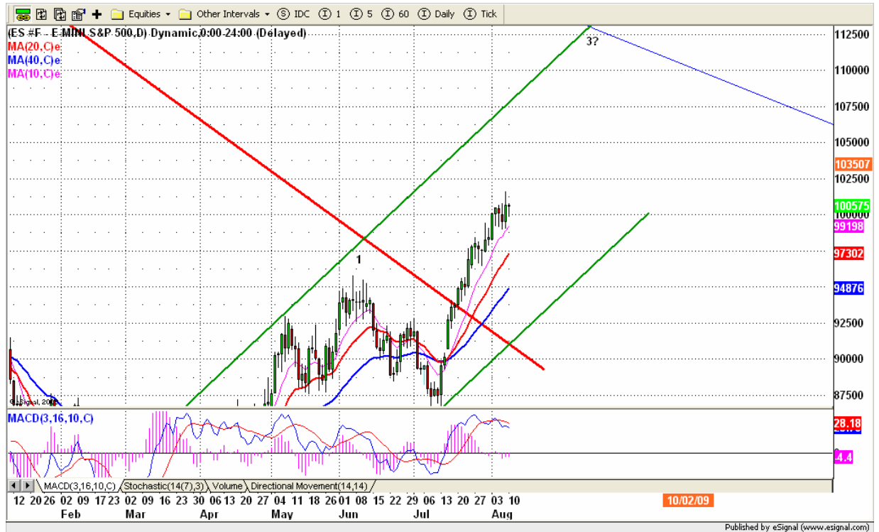
ESU9 DAILY Chart

Yesterday price action showed that the current rally could be in the last stage. The volume decreased by 66% when the price closed up. It indicates the upside move has its limits. Today a move below 989.75 will confirm that short-term Top has been posted. A retracement down to 950 area may start its processing.