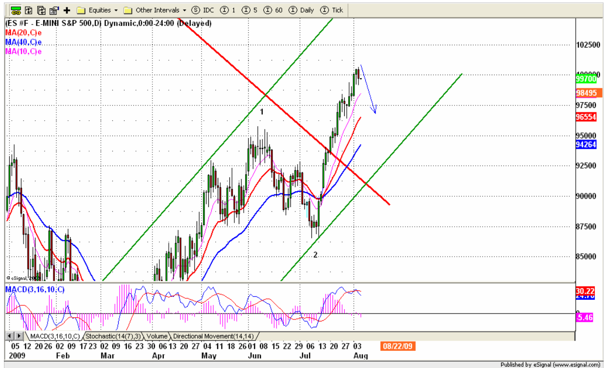
ESU9 DAILY Chart

If today's closing price is below this week's low 988.75, 20ema line area 968 will be the next target in the coming weeks.