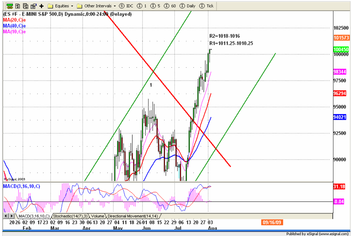
ESU9 DAILY Chart

ES already had 17 days upside move. Based on the time, the next CIT day could be around Aug. 11. There are lots of resistance levels ahead of the current price. The shorts may be little early, but buy side also is not safe.