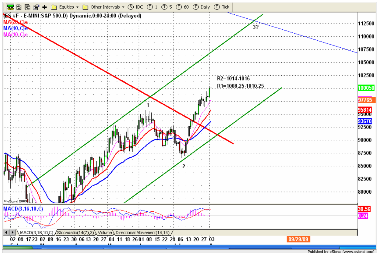
ESU9 DAILY Chart

Based on the price action in yesterday trading, it was very clear that ES intended to fill Nov. 4's gap 1003.25. Several incomplete bullish patterns remain attractive for the latest buyers. Today we may see ES make a continuation high again if 996-995 range is holding up. But the pace upside may not be as fast as on the declining side. Buyers are dancing on thin ice. Watch your step.