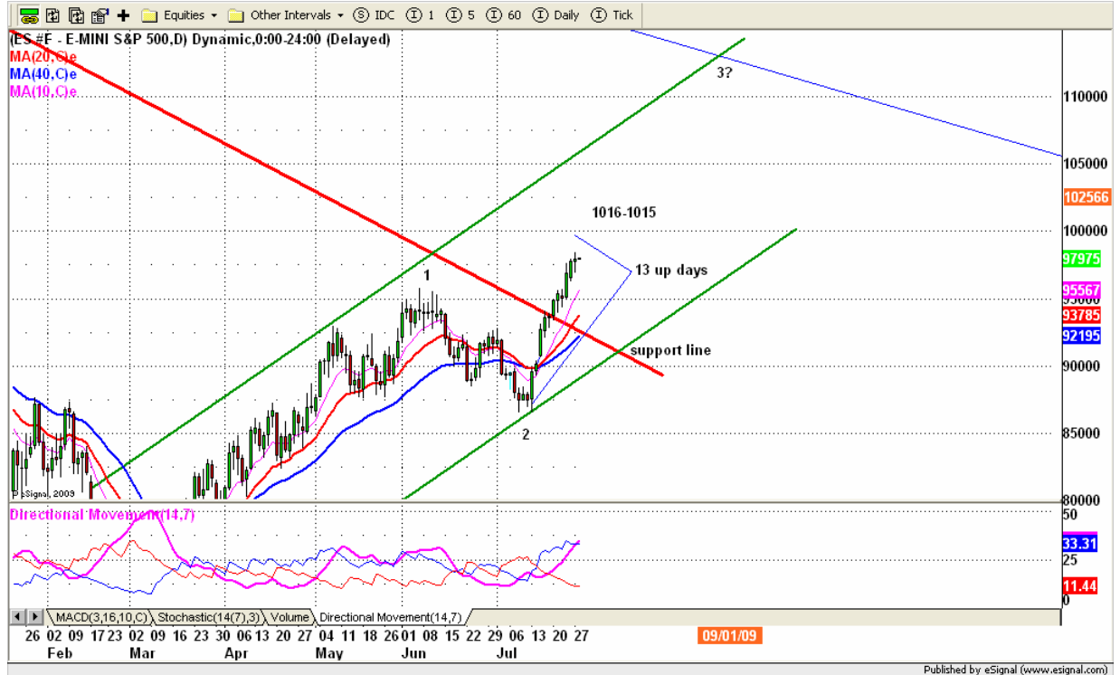
ESU9 DAILY Chart

Usually the third wave is longer lasting. As long as 957 breakout line holds up and acts a strong support level, it could take many weeks to complete this third wave.