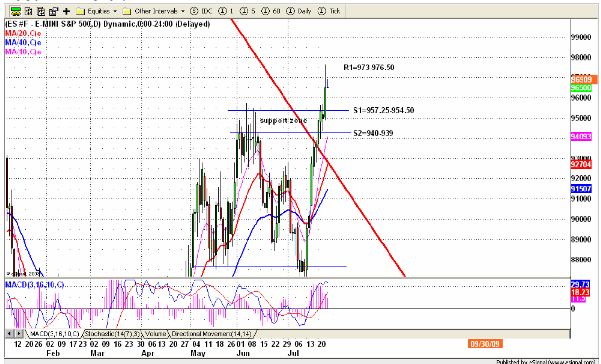
ESU9 DAILY Chart

ES finally made its upside breakout move yesterday. It broke out last June's high zone 957.50-954.50 and held up the gain for closing. But at the end, the sellers showed up, and today early morning we may see a continuation selling pressure and yesterday's breakout zone area may need to be retested again.