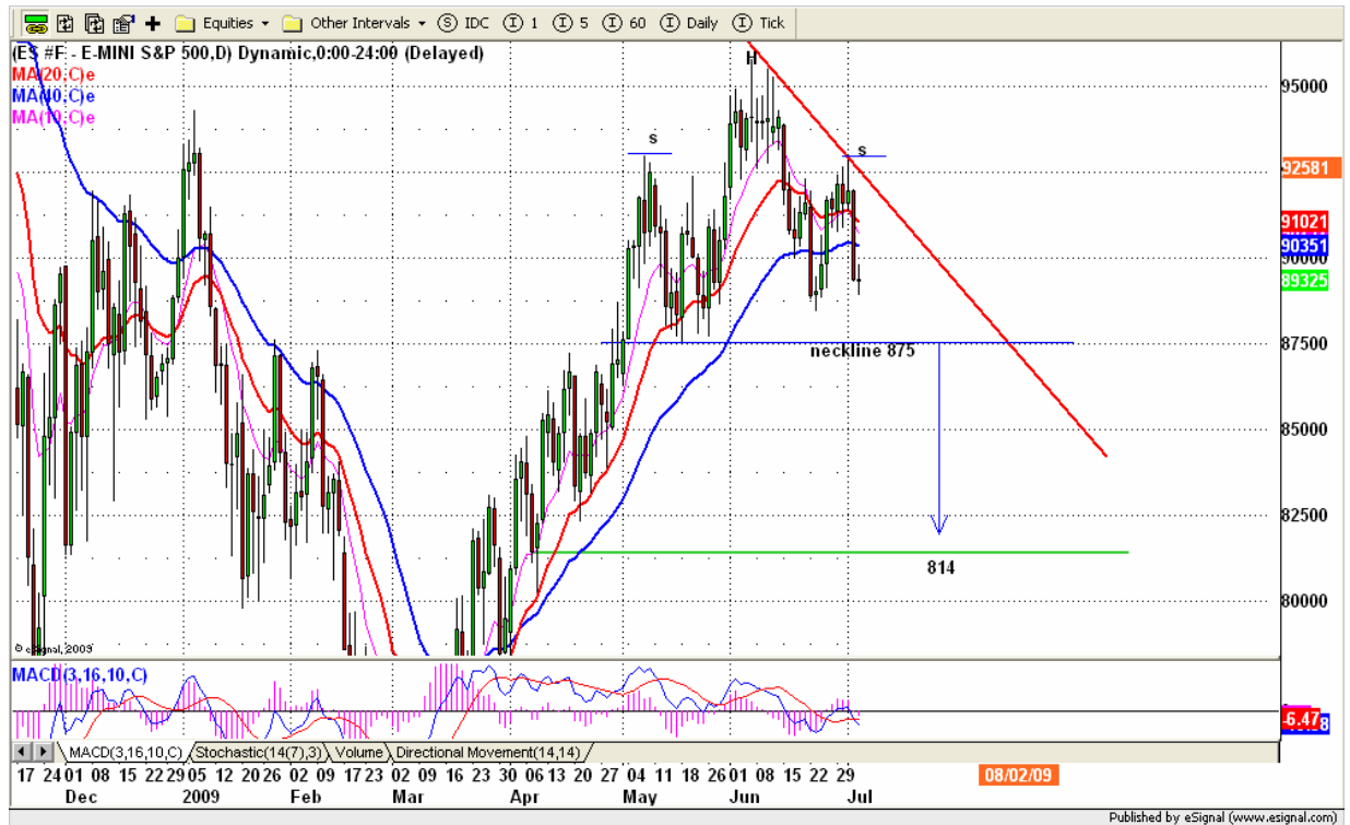
ESU9 DAILY Chart

ES formed a right shoulder top on Wednesday and sold off the following day. The sell off action will temporarily ruin the confidence of bulls. If 885 line holds up the price today, we may see sideways bounce chewing up the time. Once price breaks down 875 line, the decline will move ahead towards 840 and 814 targets.