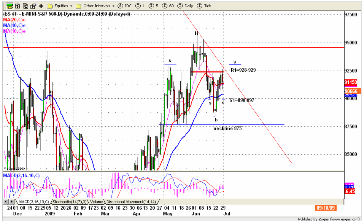
ESU9 DAILY Chart

ES is struggling. It can't breakout of the long term resistance line, but also can't breakdown short term support line. It is caught between them for consolidation. ES can not give us which direction it really wants to go until one side gives up. So be patient. Especially since we are in a short week.