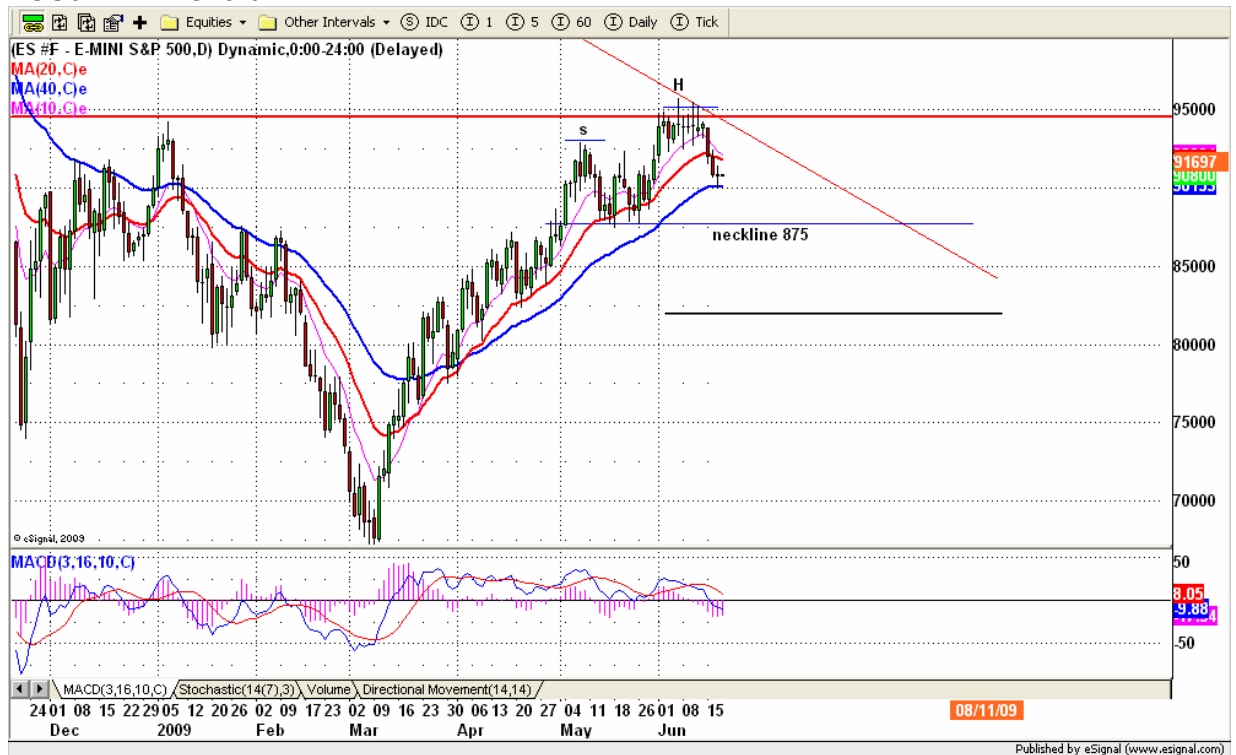
ESU9 DAILY Chart

First thing first, look at how that potential H&S pattern on daily chart forms. Step by step, 900-896 is first destination of current downside move and 875 neckline will be next. As long as ES close above 919 line, we are still SHORT on BOUNCE