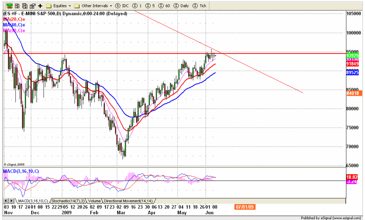
ESM9 DAILY Chart

ES continued going sideways instead of declining. It has been in contraction mode for about 7 days now. Today we may see a breakout move. This breakout can be either direction. But if ES breaks down, don't expect too much down. 895 is major support level