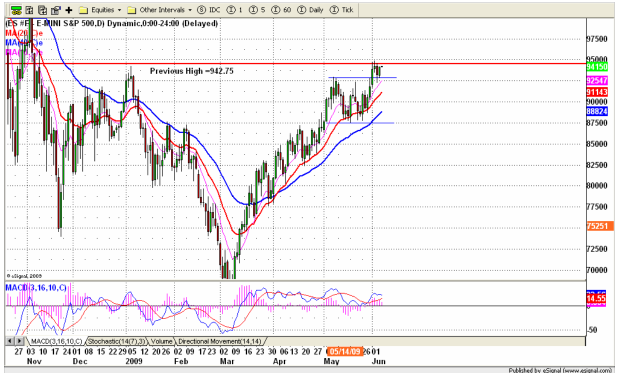
ESM9 DAILY Chart

One day up and one day down, ES keeps dealing with its previous high range (942.75-951). Today ES could make a breakout move to push price up to extremely higher level 958-963 or remain in a narrow range to repeat yesterday's move.