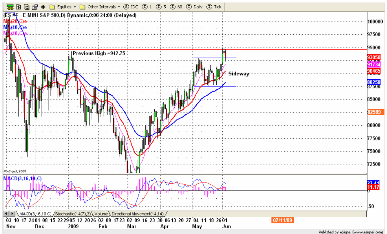
ESM9 DAILY Chart

After a narrow range day, ES had a breakdown move in the early morning, but managed to recover half the loss for closing. Today we may see ES make one more modest new recovery high move before it sells off again. The reason is that yesterday ES made a successful retest of last Monday's breakout range 929-25 and closed above this range. It should attempt to make either a double top 949-951 area or higher 958-964 range to squeeze the shorts and build a large selloff force.