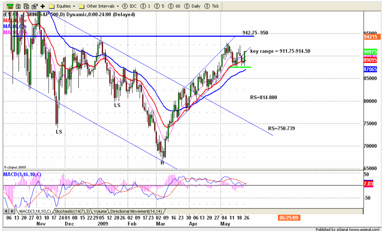
ESM9 DAILY Chart

Today we may see a very choppy movement and price traveling within a very narrow range.