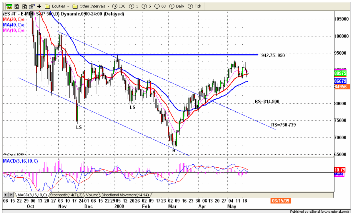
ESM9 DAILY Chart

Today we may see ES continues going higher to retest broken support line 895-896 area and attempt to fill yesterday's gap 900. As long as 906-908 range holds the price down, the short term trend remains down.