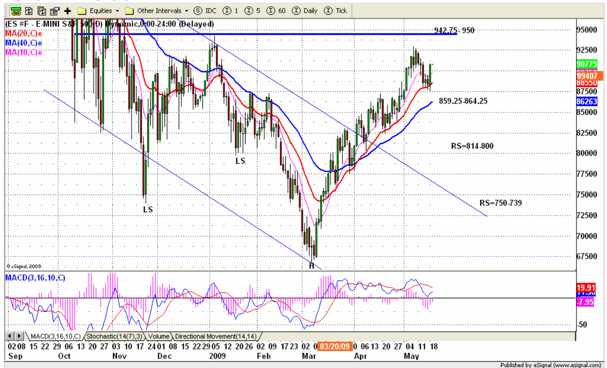
ESM9 DAILY Chart

Based on yesterday’s strong advance/decline ratio (8:1), and closing price above 10 day moving average line, there is a possibility the upside move could continue. But based on last week’s move, the upside could be stopped by the middle of the session today. We need to see how the price reacts to the important resistance around 916.75-918.50. If ES fails to breakout this range, it is probable for it to pull back to retest the 10 and 20 daily moving average lines. The 878-875 range support remains a key level. A move below it will be bearish.