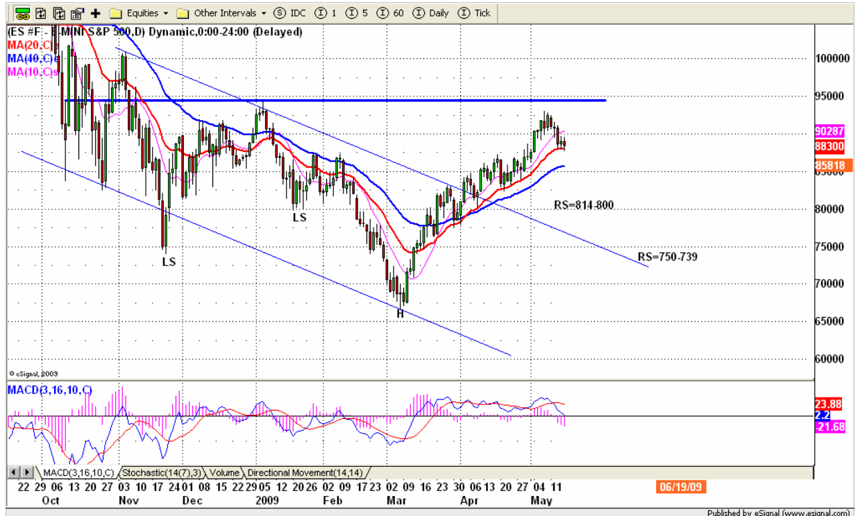
ESM9 DAILY Chart

On the daily chart, we have been talking about inverted H&S pattern for weeks. A break below 858 line will confirmed that the movement toward a right shoulder's low in the 800-750 range is underway. If the economic reports continue to show a weak or non-existent economic recovery this week, it will be difficult for the market to hold the current level.