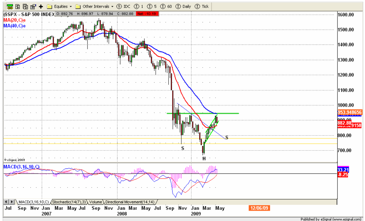
SPX DAILY CHART

Major monthly resistance level 950 and support level is 800 Weekly resistance level 910 and support level is 825