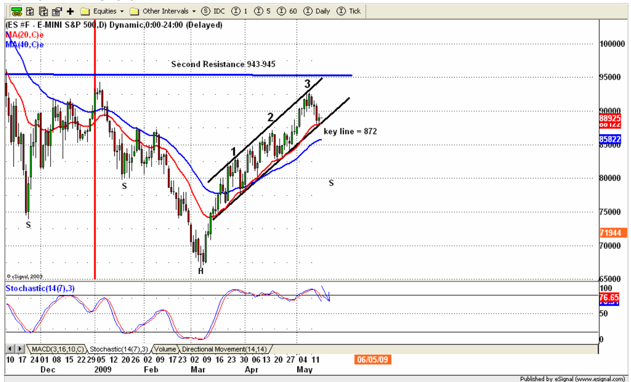
ESM9 DAILY Chart

Option expiration day !!! Warning: anything can happen today. First there are lots of economic reports that will be out in the early morning. ES may run up first to retest yesterday's high or a little bit higher before it sells off again. Or ES may just go straight down below 875 line before the open if all reports are unexpectedly bad. If ES does go down below 875 before the market opens, it could go down further if it fails to fill the gap in the first hour trading.