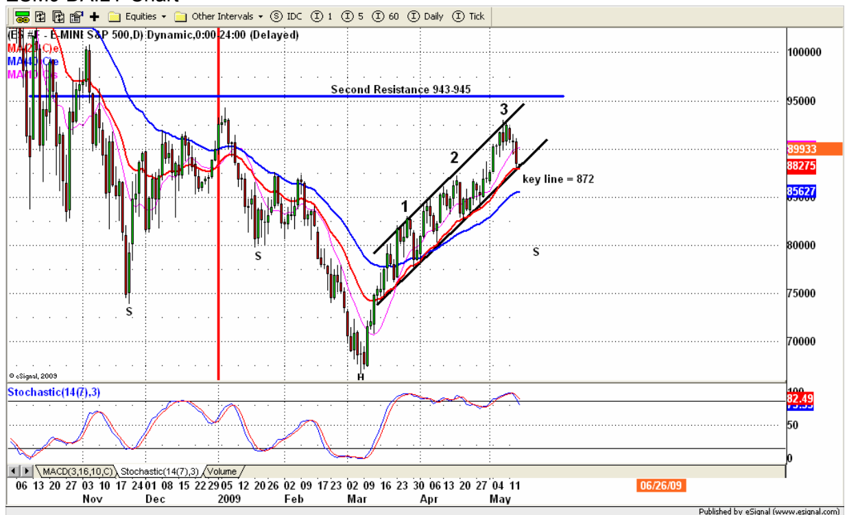
ESM9 DAILY Chart

ES broke its 9-day moving average support line and barely held above the low line of recent uptrend channel. It appears on the daily chart that ES had completed its 1-2-3 high push movement and did some short-term retracement in the past two days. This retracement may be last until next week. There is a potential inverted H&S pattern on daily chart. If ES fails to hold above 850, it is likely for ES to dip down to form a right shoulder's low around 800 area or lower to 750 area. Step by Step, as long as today ES is holding above 856 line, and the fast ema line doesn't cross its slow ema line, we should not assume that current pullback is a new decline in the bear market i.e. treat it as a retracement, not a change in the short-term trend.