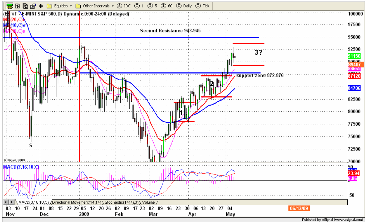
ESM9 DAILY Chart

After another 6 days of popping, ES decided to pullback for profit taking yesterday. Did ES invalidate the short-term uptrend? No is my answer. It is only small retracement before the option expiration week. Today if ES can hold up yesterday's low, then yesterday's high still has a chance to be retested. ES still can push price up to fill Jan 7's gap around 930-932.50 area or higher. Bank stress tests all are done. The investors will be back to focus on economic news.